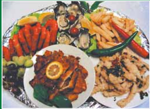
A Cooked King Prawns, Sydney Oysters 'Guangshou' pepper & salt squid, H's boneless lemon chicken. Queensland mud crab extra.