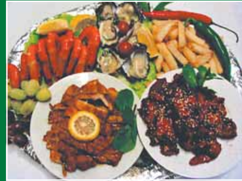
C Cooked King Prawns, Sydney Oysters H's boneless lemon chicken, Peking pork spare ribs. Blue Swimmer extra.