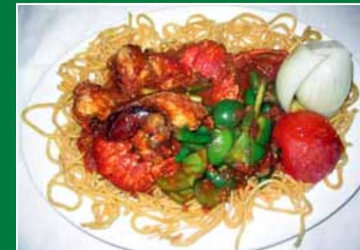
H North Queensland lobster tail & egg noodles