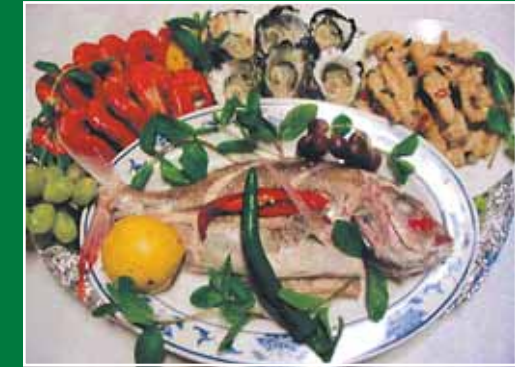
D Cooked King Prawns, Sydney Oysters 'Guangshou' pepper & salt Squid, Snapper or Barra - bugs tail extra.