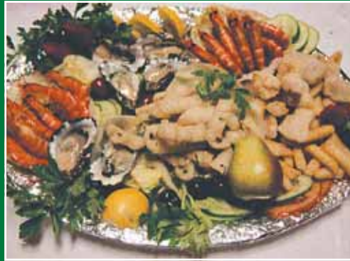
B Cooked King Prawns, Sydney Oysters 'Guangshou' pepper & salt squid, Barramundi fillet in pepper & salt. Queensland mud crab extra.