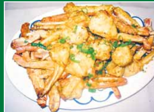
G Tropical Blue Swimmer (pepper & salt)