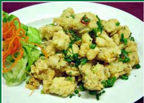
E W.A. Blue Swimmer Meat (fried)