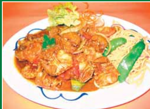
F Tropical Bugs Tails & noodles or B. rice.